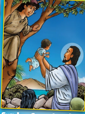
Sunday Gospel Gallery

Which word or words stood out for you in this Sunday's Gospel, and why? Spend a few relaxing moments pondering the picture together. Share any thoughts before moving on.